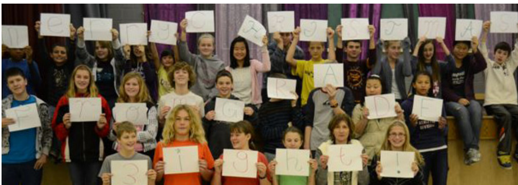
MERRY CHRISTMAS FROM GRADE EIGHT